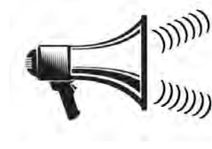
Sound Diffuses Limited Communication Distance Poor Voice Quality