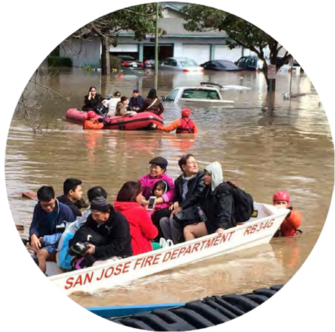
After Hurricane Katrina, the 2010 earthquake in Haiti, the 2011 earthquake and tsunami in Japan, 2013 flooding in Boulder CO, 2014 landslides in Oso, WA, and 2017 flooding in San Jose, CA – LRAD systems were deployed to communicate rescue instructions to those stranded, and relief and humanitarian assistance information to survivors.