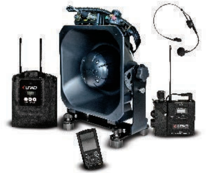
MAGNET BASE SYSTEM PROVIDES 600 LBS. OF HOLDING AND 120 LBS. OF SHEAR FORCE; ACCOMPANYING MOUNTING YOKE SECURES TO METALLIC SURFACES INCLUDING VEHICLE ROOFS.