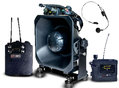
MAGNET BASE SYSTEM PROVIDES 600 LBS. OF HOLDING AND 120 LBS. OF SHEAR FORCE; ACCOMPANYING MOUNTING YOKE SECURES TO METALLIC SURFACES INCLUDING VEHICLE ROOFS.