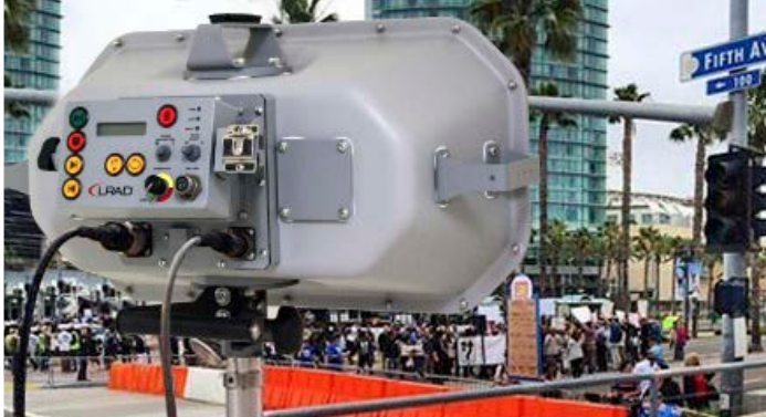
Crowd Communication/Incident Management