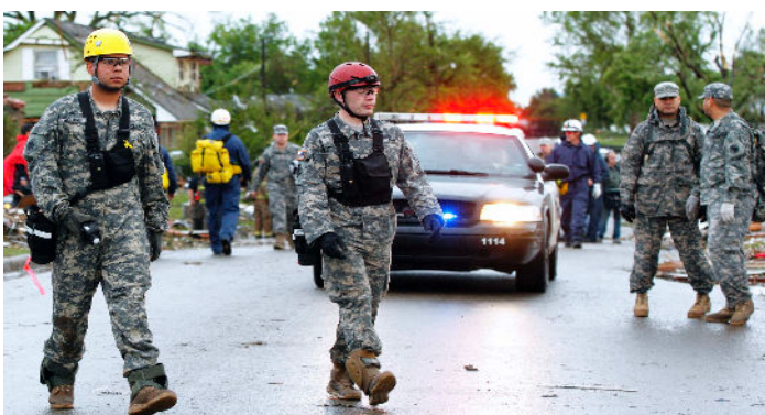
Humanitarian Missions/Disaster Response