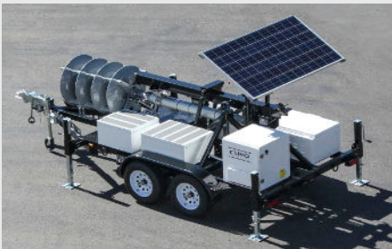
360XT IS AVAILABLE WITH AN OPTIONAL SOLAR PANEL FOR REMOTE CHARGING CAPABILITY

The 360XT Mobile Mass Notification System (MMNS) delivers Genasys' world renowned, highly intelligible voice and warning tone broadcasts with perfect 360° coverage on wheels.